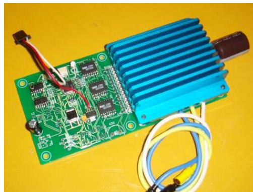
Model name : BL-ESC-100V120A-CP-01 Input power ; 7.5Kw Operating voltage / current : 24-75V/100A Size : W60 × H40 × L130 Weight : 0.24Kg