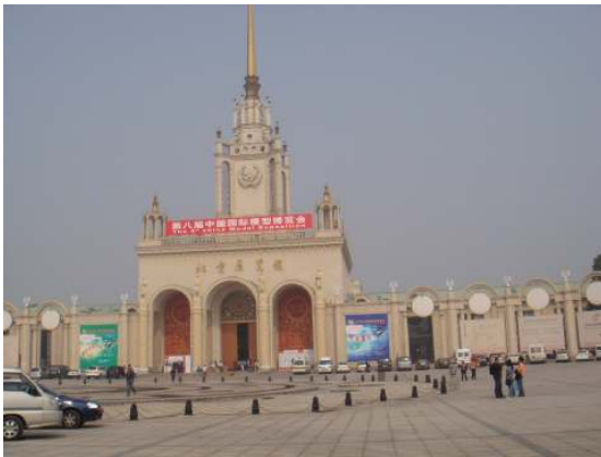
Beijing Exhibition Centre

Followings are pictures of the 8th China Model Exposition and our main products for the exhibition.