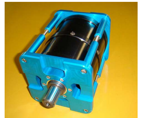
Model name : BLM-10803-140 Output power ; 13Hp Operating voltage / current : 24-75V/100A × 2 size : W140 × H140 × L240 weight : 6.95Kg