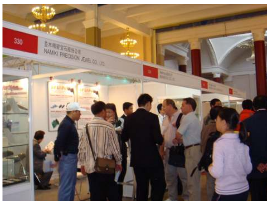
Namiki's booth with interested participants