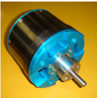
Model name : BLM-10803-132 Output power ; 8Hp Operating voltage / current : 24-25V/100A size : W130 × H130 × L120 weight : 3.6Kg