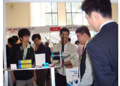
Small and light brushless direct drive motor with high power, and its controller for the exhibition