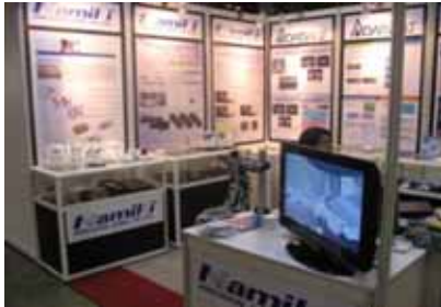
Layout of the booth

A total of 527 exhibitors were on show at the Globaltronics covering 12,000sqm. The show attracted 10,000 visitors.